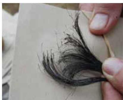
Pulling of tail hair