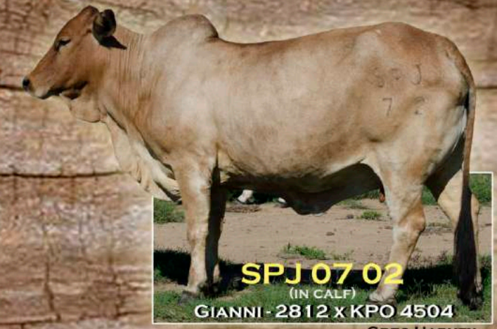
SPJ 07 02 (IN CALF) GIANNI - 2812 X KPO 4504 GREG HARVEY

UNDER THE AUSPICES OF THE BORAN CATTLE BREEDERS' SOCIETY