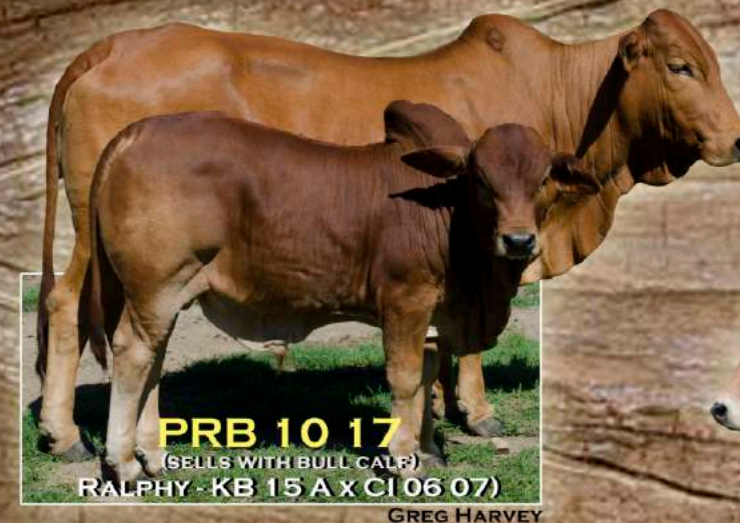
PRB 10 17 (SELLS WITH BULL CALF) RALPHY - KB 15 A X CI 06 07 GREG HARVEY