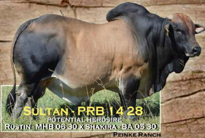
SULTAN - PRB 14 28 POTENTIAL HERDSIRE RUSTIN - MHB 06 30 X SHAKIRA - BA 05 30 PEINKE RANCH