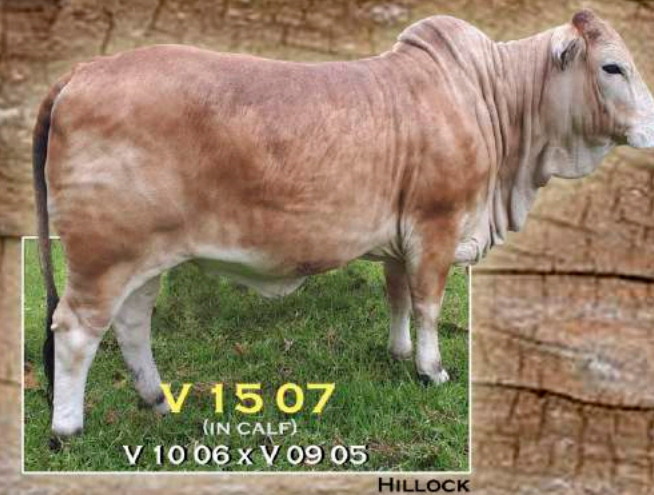
V 15 07 (IN CALF) V 10 06 X V 09 05 HILLOCK