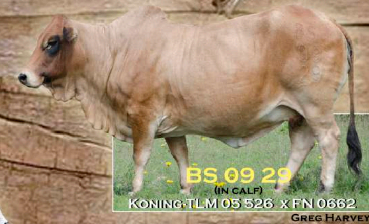
BS 09 29 (IN CALF) KONING - TLM 05 526 X FN 0662 GREG HARVEY