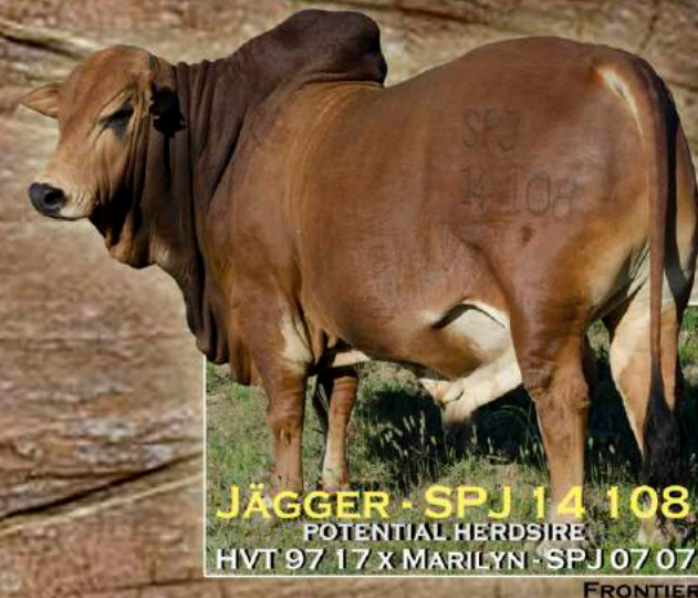
JÄGGER - SPJ 14 108 POTENTIAL HERDSIRE HVT 97 17 X MARILYN - SPJ 07 07 FRONTIER