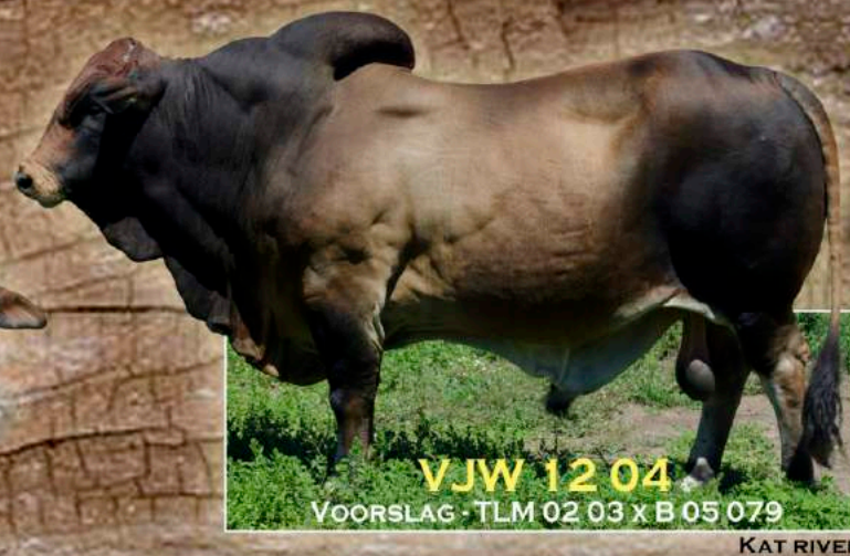
VJW 12 04 VOORSLAG - TLM 02 03 X B 05 079 KAT RIVER