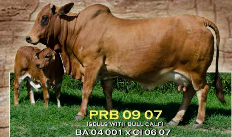
PRB 09 07 (SELLS WITH BULL CALF) BA 04 001 X CI 06 07 GREG HARVEY

FRIDAY, 20TH APRIL 2018, 11AM - GRAHAMSTOWN AUCTION YARD