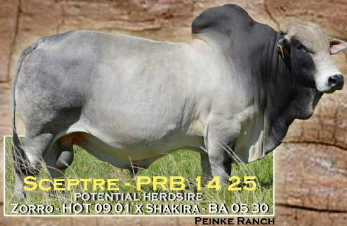
SCEPTRE - PRB 14 25 POTENTIAL HERDSIRE ZORRO - HOT 09 01 X SHAKIRA - BA 05 30 PEINKE RANCH