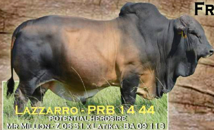
LAZZARRO - PRB 14 44 POTENTIAL HERDSIRE MR MILLION - Z 06 51 X LATIKA - BA 09 113 PEINKE RANCH