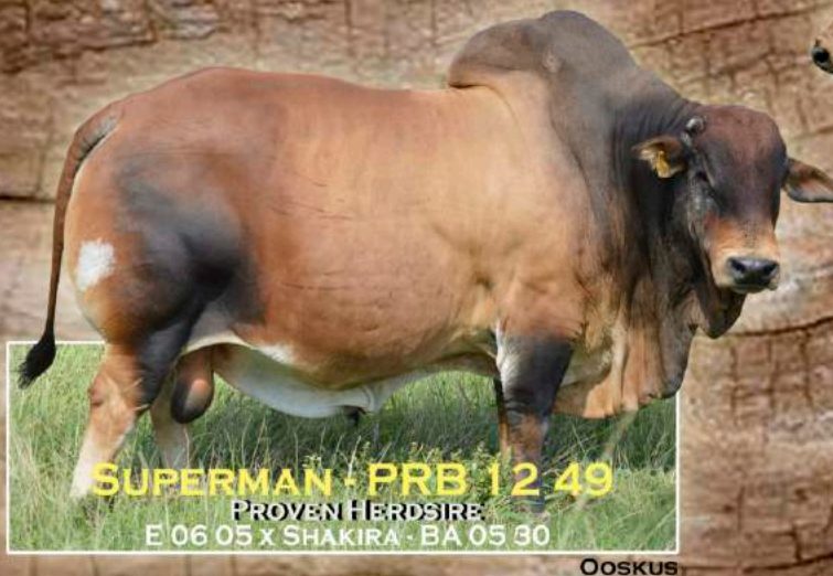
SUPERMAN - PRB 12 49 PROVEN HERDSIRE E 06 05 X SHAKIRA - BA 05 30 OOSKUS